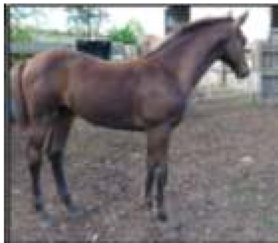
WARREL PARK CASPIAN $6000 Mature

Great unflappable nature - lovely strong conformation. Handled & rugged since birth, ready to go. DOB 21/9/10, Reg & Classified. By Belcam Agassi out of Avedeen Caramia (Classic). Bred to jump or event (dam has Sir Tristram blood-